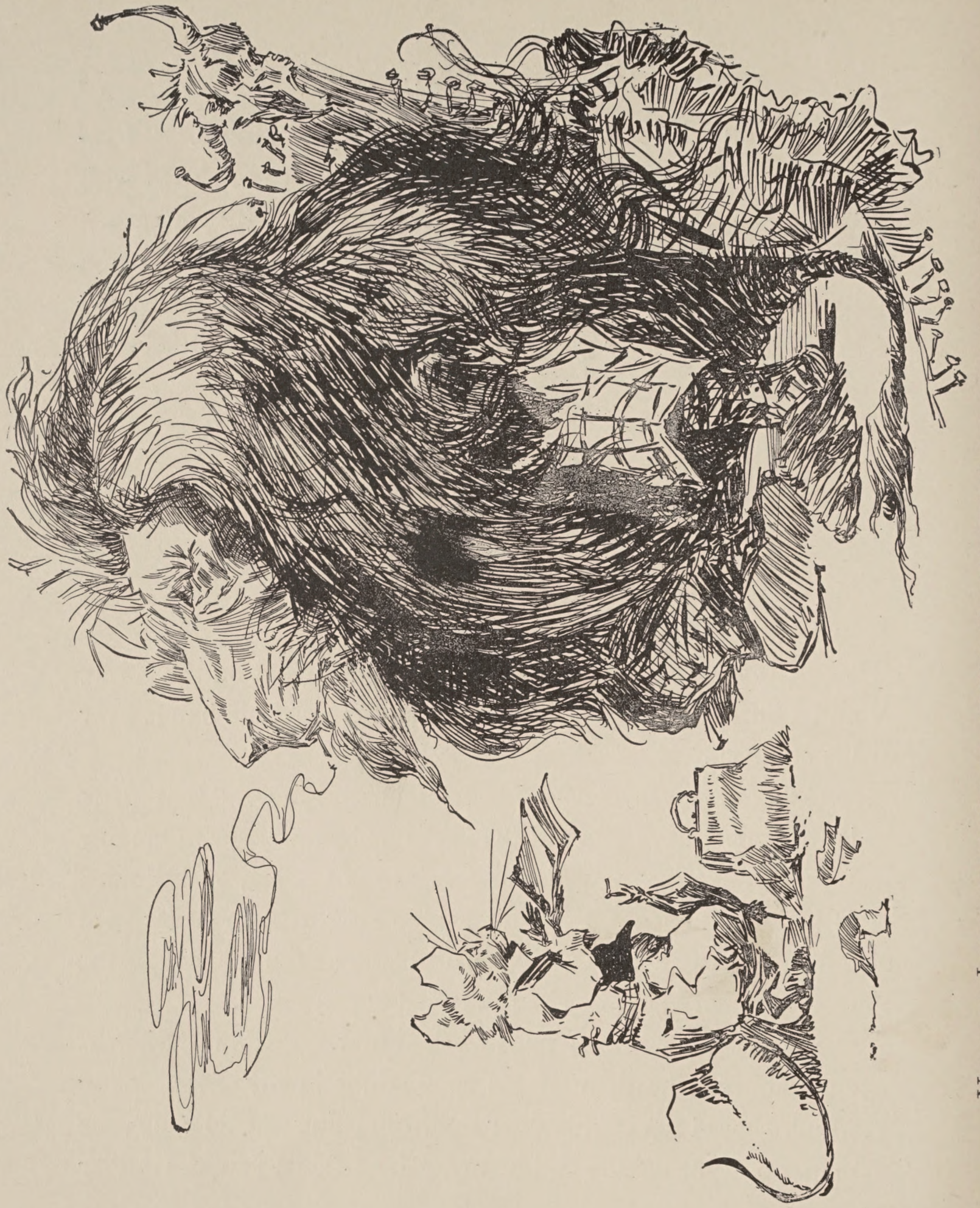
YELLOW LION INQUIRES IF THERE IS ANYTHING IN THE BOOK ABOUT HIM.